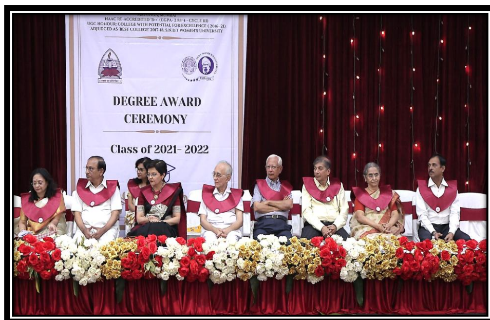
A glimpse of the dignitaries on the dais