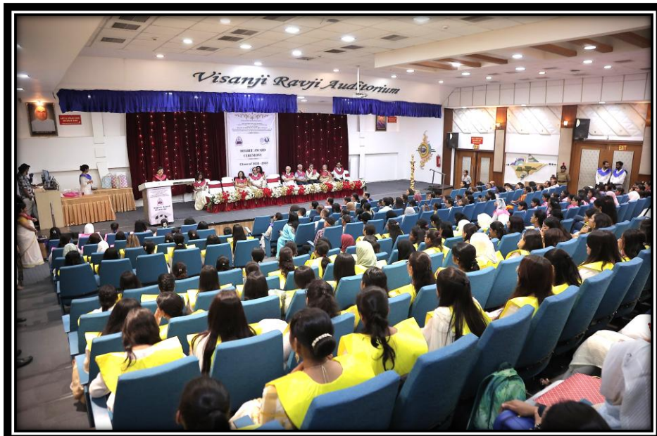
Glimpses of the audience