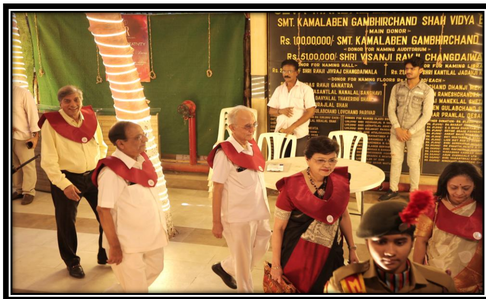
Arrival of the chief guest, management members, Principal Incharge and rank-holders with the graduation ceremony procession.