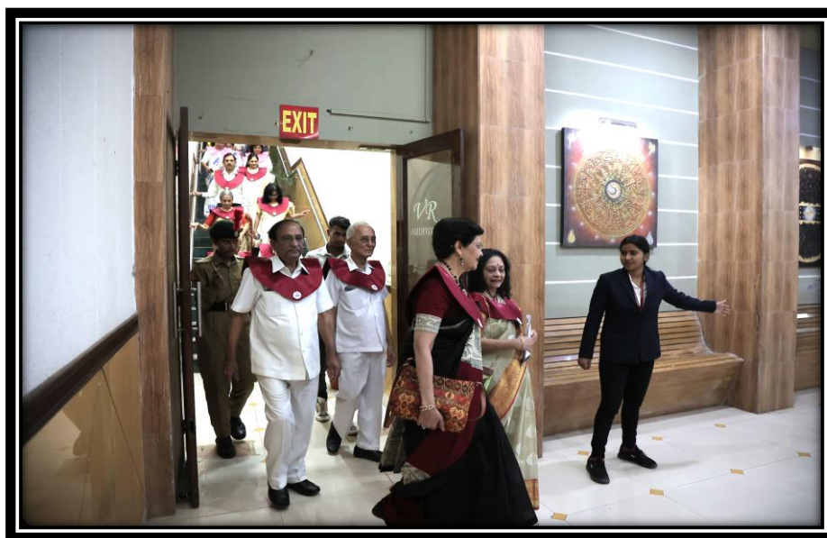
Arrival of the chief guest, management members, in charge principal with the graduation ceremony procession.