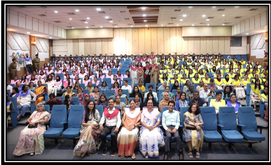
All the dignitaries and senior faculty members with the audience