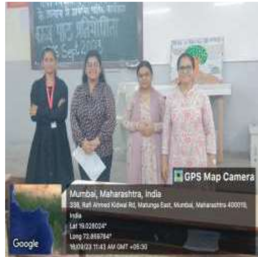
Figure 3: Hindi Pakhwada