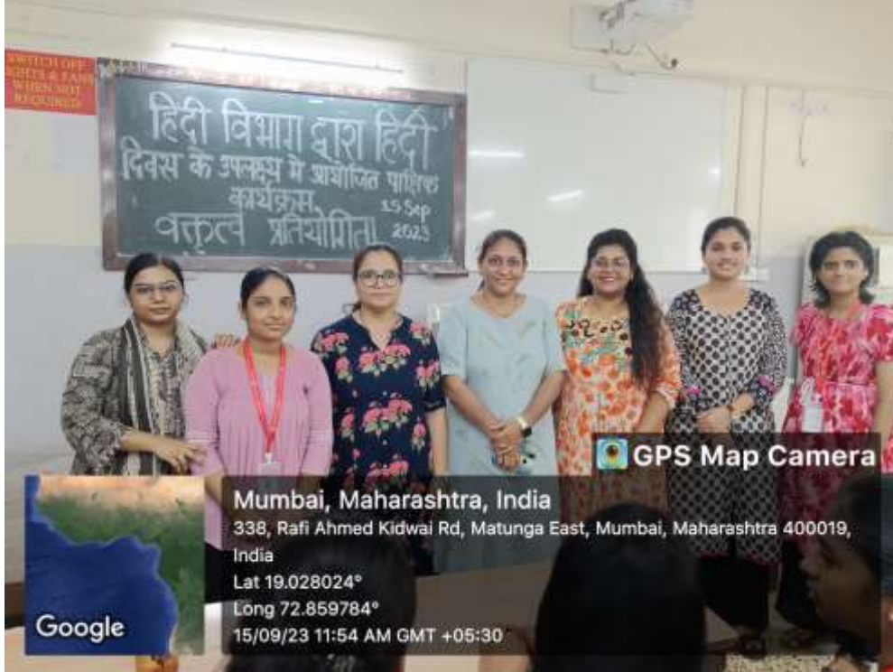
Figure 11 Hindi Pakhwada

हिन्दी विभाग द्वारा हिन्दी दिवस के उपलक्ष्य पर 'हिन्दी पखवाड़ा - 2023' मनाया गया। जिसके अंतर्गत विभिन्न भाषिक एवं साहित्यिक गतिविधियों का आयोजन किया गया था।