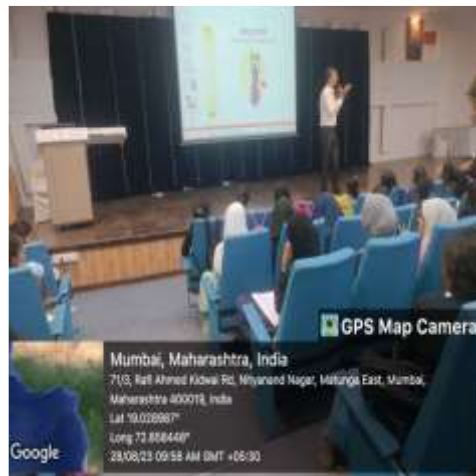
Figure 1: Session on Smart Girl