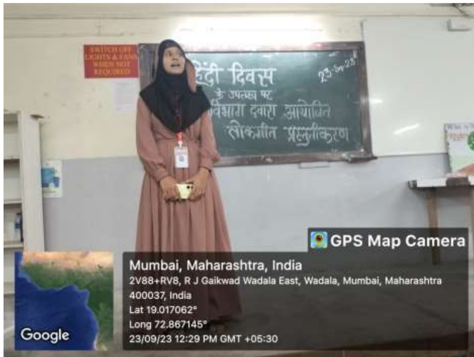
Figure 14: Hindi Lokgeet aayojan