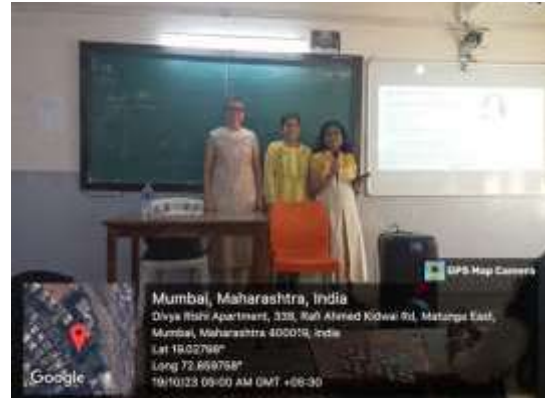
Figure 7: PCOS Awareness session