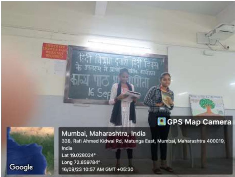
Figure 12 Hindi Kavya Path