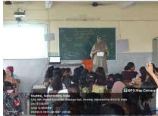
Figure 5: Session on Body Image