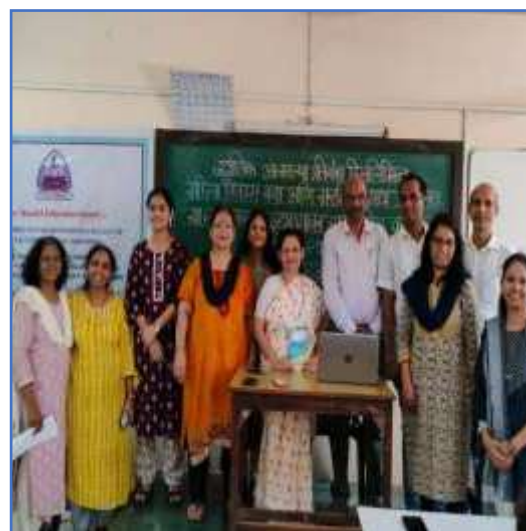
Figure 2: जागतिक आत्महत्या प्रतिबंध दिन