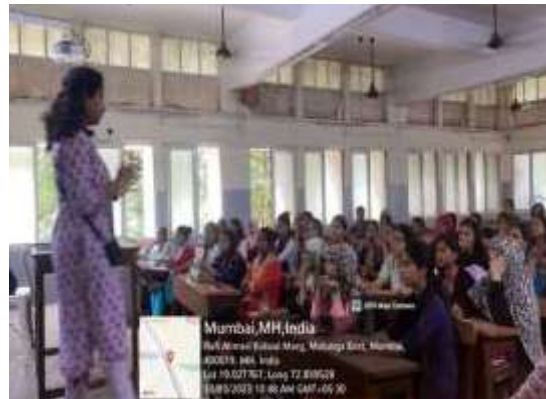
Figure 6: Employability Skills Training Program- Orientation by TNS India Foundation