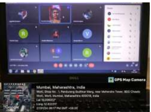
Figure 10: Online National Kavya Sammelan Mahila Ranglya Kavyat