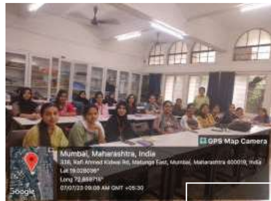
Figure 4: PRIDE AND INCLUSION by Samvedana Counselling Centre