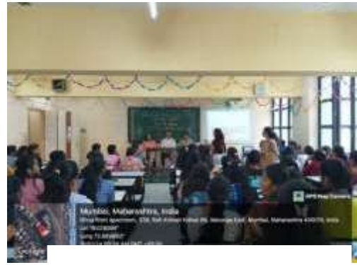
Figure 9: मोडी लिपी कार्यशाळा